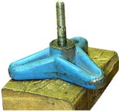
1. Hammer out the stripped bolt.